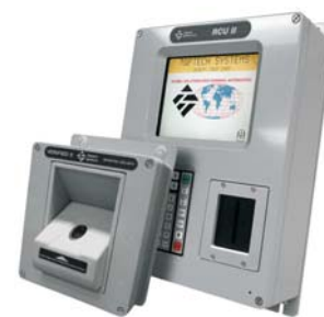
verifID II & RCU II