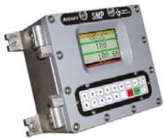
Small SMP Enclosure (Division 1)