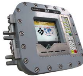
EXL Enclosure (Division 1)