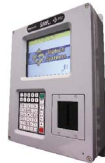
Division 2 Enclosure